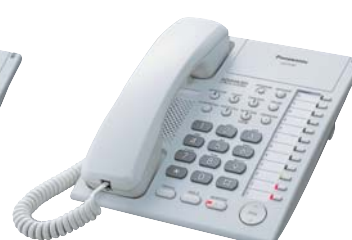
■ KX-T7750 Monitor Unit